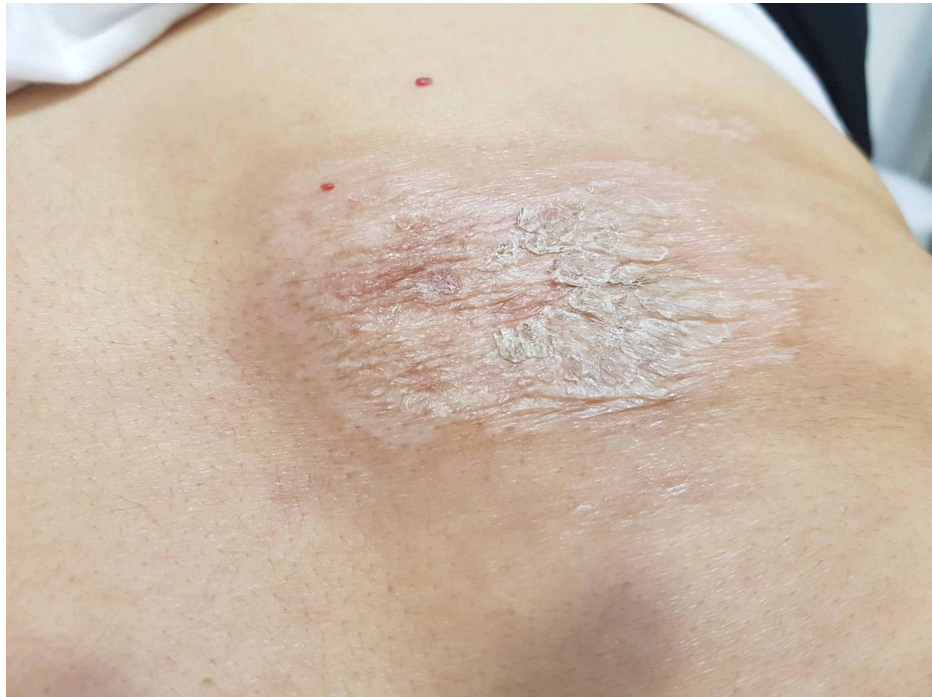
FIGURE 3: An improvement after 1 month of applying high-potency topical corticosteroid.

The patient was managed with high-potency topical corticosteroid ointment, twice daily for one month. The patient showed improvement (Figure 3).