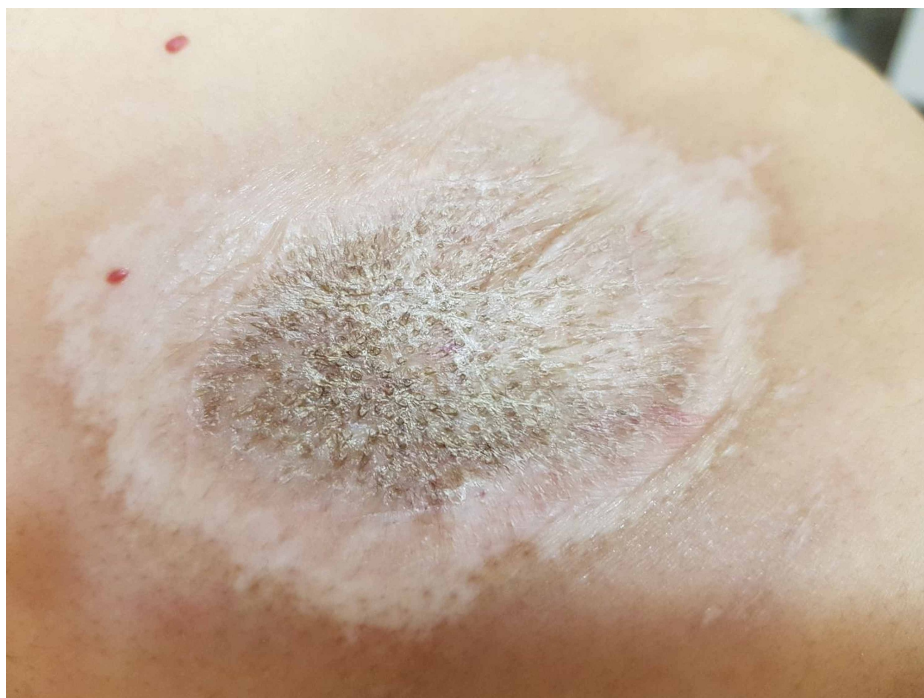
FIGURE 1: Hypopigmented atrophic plaque with wrinkled texture and follicular plugging.

On clinical examination, a hypopigmented atrophic plaque with wrinkled texture and follicular plugging involving the upper back was observed, measuring 7 cm by 10 cm (Figure 1).