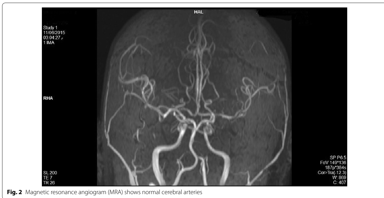
Fig. 2 Magnetic resonance angiogram (MRA) shows normal cerebral arteries

cortex [8]. This allows for disinhibition of facilitator neurons resulting in excitatory cell overactivity and unopposed (generally enhanced) excitatory nerve activity, as a result, initial subjective symptoms of CNS toxicity include signs of excitation (Fig. 3) such as lightheadedness and dizziness, difficulty focusing, tinnitus, confusion, and circumoral numbness [9, 10]. Likewise, the objective signs of local anesthetic CNS toxicity are excitatory, for example, shivering, myoclonus, tremors, and sudden muscular contractions [11]. As the local anesthetic level rises, tonic-clonic convulsions occur. Symptoms of CNS excitations typically are followed by signs of CNS depression. Seizures activity ceases rapidly and ultimately is succeeded by respiratory depression and respiratory arrest.