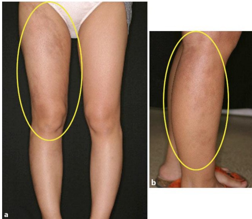
Fig. 1. Skin symptoms upon first examination. Sclerosis of the right thigh ( a ) and crus ( b ) with a slightly clear boundary accompanied by brown pigmentation.