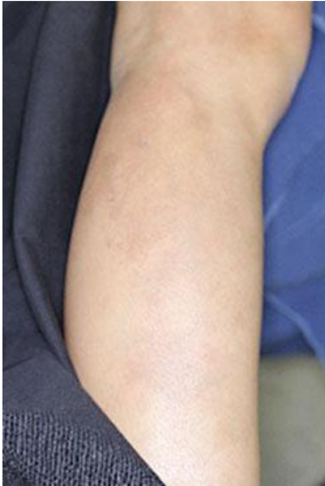
Fig. 3. Clinical findings 15 months after the discontinuation of etretinate treatment.