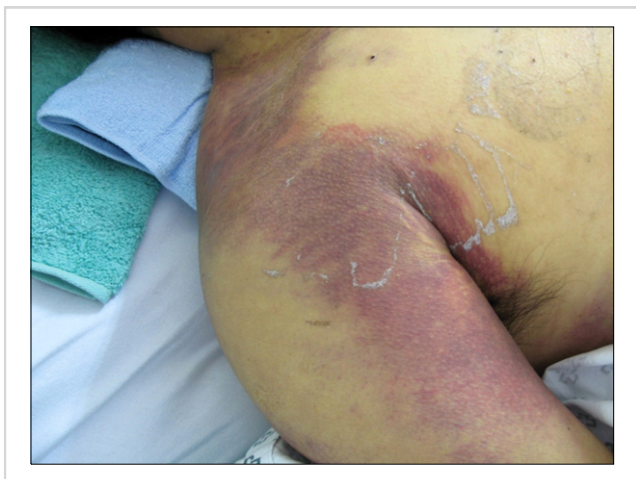
Fig. 1. Subcutaneous hemorrhage of the right shoulder, upper arm, and axilla on admission.

0-0.7 Bethesda units/mL). Lupus anticoagulant antibody, anti-nuclear antibody and anti-phospholipid antibody were negative. The level of factor XI and factor XII was normal. His chest and abdominopelvic CT scan were negative for malignancy. He was diagnosed with acquired factor VIII deficiency. Magnetic resonance imaging (MRI) of the thigh showed hematomas in the left vastus medialis muscle (Fig. 2). The patient was treated with an intravenous infusion of factor VIII 3,000 U (50 U/kg) every 8 hours. One month after treatment, the patient's symptoms improved, but his factor VIII inhibitor antibody titer was still high (147 Bethesda units/mL).