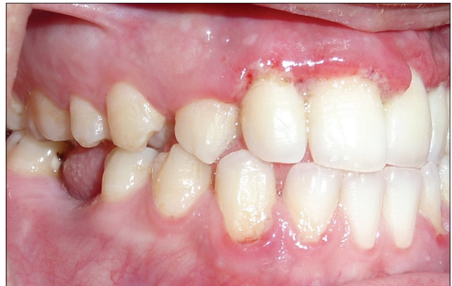
Figure 2: Baseline left side view