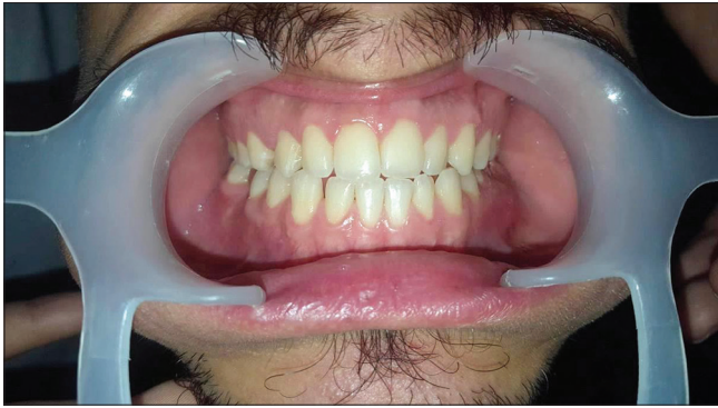
Figure 9: Final front view 9-month posttreatment