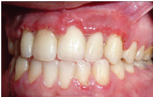
Figure 3: Baseline right view