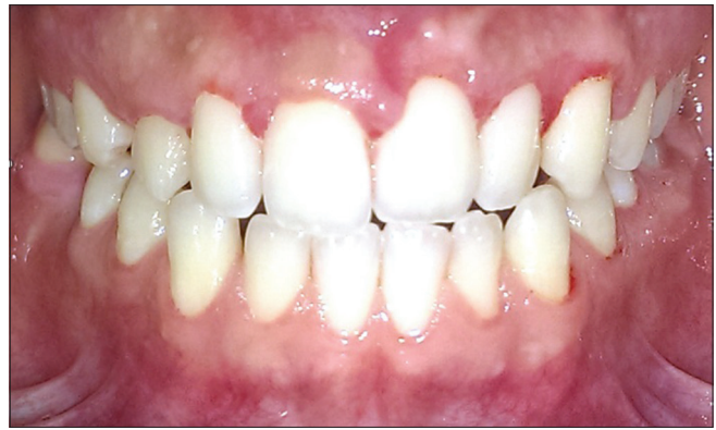
Figure 6: Front view 2 days after emergency treatment