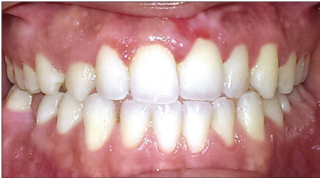
Figure 7: Front view 7 days after emergency treatment