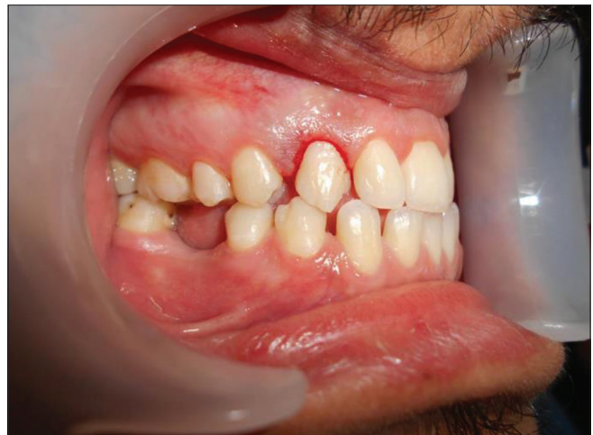
Figure 8: Gingivectomy on the tooth 23

addition to necrotizing ulcerative periodontitis (NUP) and linear gingival erythema in the group of periodontal disease-related pathologies in HIV-positive patients. [8] After that, and according to the 1999 American Academy of Periodontics classification system, NUG was classified as necrotizing periodontal disease, with NUP. This suggestion was made since NUG and NUP might possibly be different stages of the same infection. [3,8] In 2002, Holmstrup and Westergaard proposed another classification that includes three distinct illnesses within the umbrella term of necrotizing periodontal disease: necrotizing gingivitis, when only the gum is affected; necrotizing periodontitis, if periodontal attachment tissue is also lost; and necrotizing stomatitis if the tissues involved lie beyond the mucogingival border. [8]