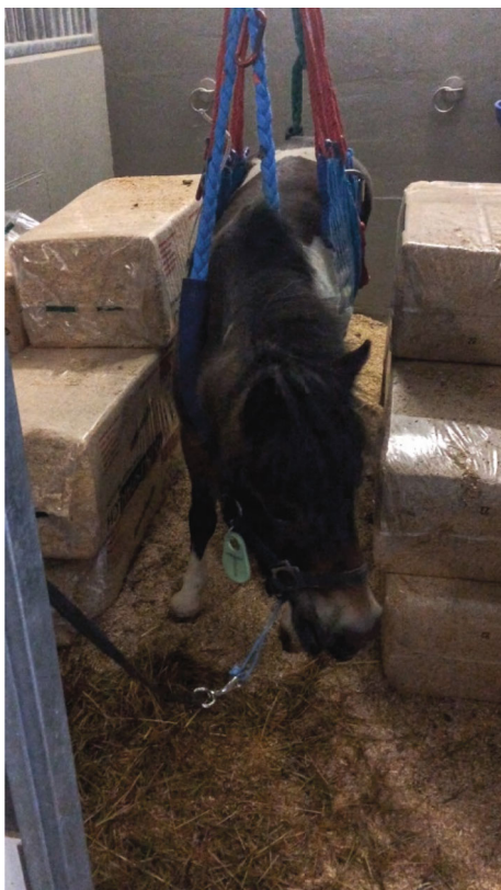
FIGURE 3: A crosstied Shetland pony mare in a full-body animal rescue and transportation sling (ARTS) after closed reduction of a right coxofemoral luxation.

the mare was kept in the ARTS to prevent her from lying down. Because intermittent left-sided upward fixation of the patella had been observed, a left-sided medial patellar ligament desmotomy was performed under local anaesthesia and sedation.