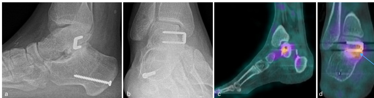
Fig. 2 Multiply operated CTEV: a) and b) plain radiographs of a 16-year-old male; multiply operated right-sided CTEV. Presented with chronic pain across front of ankle. c) and d) SPECT/CT revealed no mechanical stress at right ankle joint but presence of mechanical stress at the level of the surgical staple. Planned steroid injection at the ankle was avoided and conservative measures implemented. The patient improved with physiotherapy and better footwear.