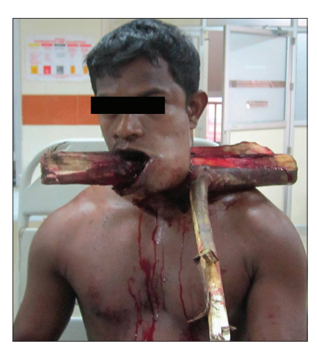
Figure 1: Front view of patient

After adequate exposure the wooden log was removed in toto [Figure 5]. Lingual and facial artery were identified and ligated with 2-0 silk. No other foreign body was seen. Hemostasis was achieved and the area cleaned with betadine saline wash. There were no injury to great vessels and nerves of neck. Reduction and fixation of fracture mandible was done by stainless steel mini pates and screws [Figure 6]. Wound was then closed in layers after securing the suction drain. Post-operative CT scan of head and neck was advised to rule out head injury,