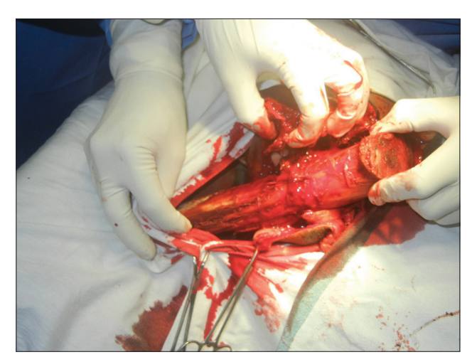
Figure 5: Removal of wooden log

Post operative evaluation showed no injury to facial and lingual nerve. The patient had an uneventful postoperative period and was discharged on the 10<sup>th</sup> day