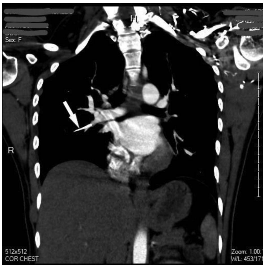
Figure 3. CT chest angiography showing the migrated Nexplanon (arrow) in the right middle lobe pulmonary artery.

Subdermal contraceptive implant embolism to the lungs and the pulmonary arteries is an emerging iatrogenic condition. In fact, 11 previously published cases in the PubMed literature have been summarized (see Table 1). In addition, a query of the Food and Drug Administration (FDA)'s Adverse Event Reporting System (FAERS) database until 2015 revealed 38 patients with etonogestrel implant migration, from which, 9 cases were in the lung or pulmonary artery. [8] Some of them did have some shortness of breath and chest pain/discomfort. Therefore, at least 21 cases (including this report) of contraceptive implant pulmonary embolization have been reported to date; raising awareness for the prevention/detection of this life-threatening complication may help reduce the risks.