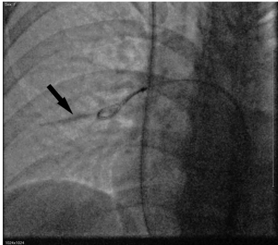
Figure 4. Pulmonary arteriography (right internal jugular vein access) showing fully intact contraceptive device (arrow) just before retrieval by an Ensnares loop.