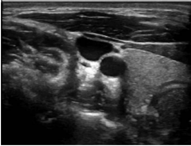
Figure 1. Intraoperative ultrasound of left arm showing no Nexplanon.

under her left arm skin; therefore, the standard removal procedure could not be done.