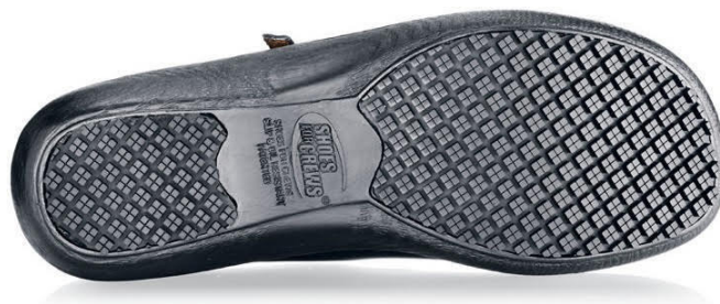
Figure 1 Example of sole of intervention footwear.

Participants were inducted into the trial with a welcome text message followed by a pre-randomisation 'run-in' period of data collection in the form of weekly text messages, for up to 6 weeks, requesting data on slips at work in the previous week. The purpose of the 'run-in' period was twofold: to provide a baseline slip rate; and to assess for engagement with the text message data collection process. By only randomising participants who provided slip data for at least 2 weeks, we hoped to maximise response to the post-randomisation outcome texts. Participants were randomised 1:1 to either be offered and provided with a pair of 5* GRIP-rated slip-resistant shoes or asked to wear their usual work shoes. Randomisation was through the University of York,