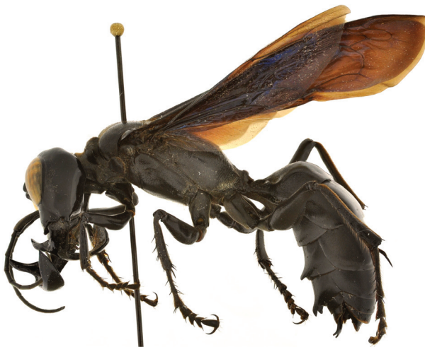
Figure 3. Habitus of Megalara garuda . Photo: Kimsey and Ohl, 2012. ZooKeys: doi: 10.3897/zookeys.177.2475

An unusually large wasp species, named by the authors Megalara garuda , was discovered during an expedition to the Indonesian island of Sulawesi (Kimsey and Ohl 2012). With a body size of 32–34 mm and fearful jaws in males, the new species differs from all known related digger wasps, so much so that it was placed in a new genus of its own, Megalara .