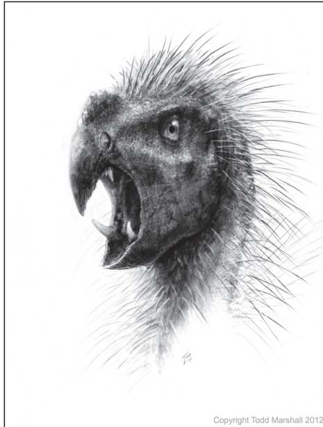
Figure 2. The head of Pegomastax africanus . Reconstruction by Todd Marshall, 2012.

beak, bristles and fangs, USA Today : Fanged dinosaur feasted on fruit, Time : A parrot-headed, big-fanged, porcupine dinosaur.