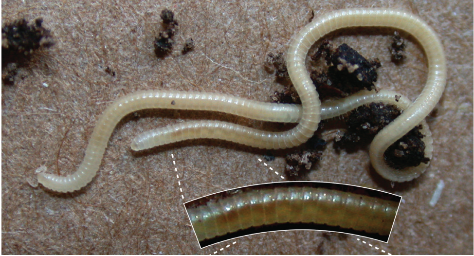
Figure 5. Habitus of live Illacme plenipes ♀ with 170 segments and 662 legs.