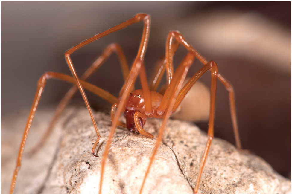
Figure 4. Habitus of live Trogloraptor marchingtoni .

International recognition was received also on the discovery of Kollasmosoma sentum , a new tiny parasitic braconid wasp with unusual behavior (Gómez Durán and Achterberg 2011). It was selected by the International Institute for Species Exploration and included in their 2011 top 10 list of world’s most interesting new species.