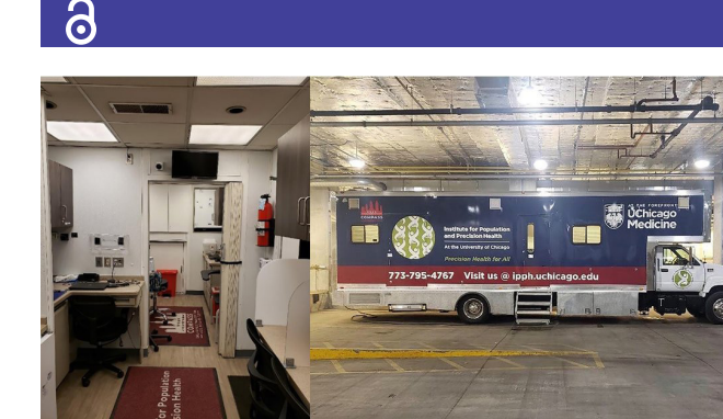
Figure 2 An IPPH mobile unit used for COMPASS enrolment.

achieved a much higher response rate in African-American communities than anticipated.