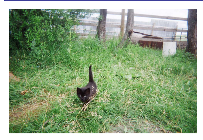
Figure 2 Isolation.

represent the loneliness experienced by the sick patient with cancer expressed,