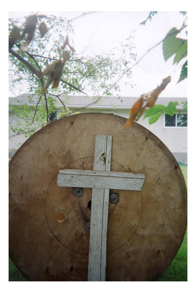
Figure 5 God's will.

This study explored adolescents' understanding of cancer where metaphors were very prominent in the cancer discourse. Adolescents in our study described