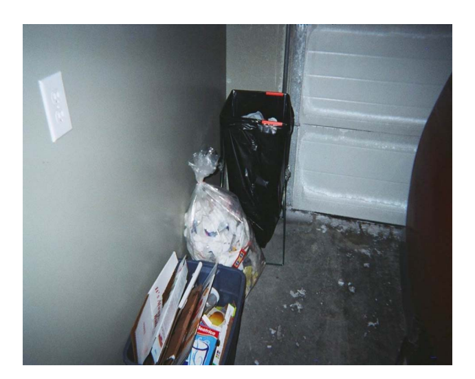
Figure 4 Polluting cells.

Adolescents noted that cancer cells grow fast and also live longer than normal cells as noted by the following,