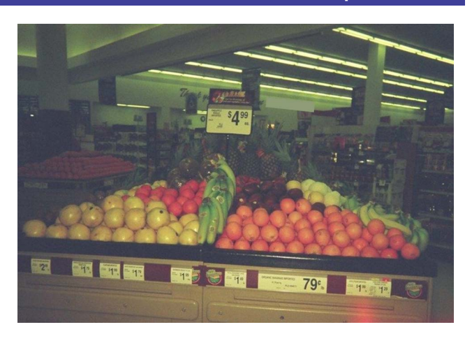
Figure 3 Preparing the soldier.

Like not eating healthy can break down your immune system which in the end if you were to get cancer then it'd be harder to fight off the cancer...Eating healthy is just one small thing that if you were to get cancer, it