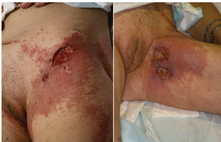
Figure 1. (A and B) Retiform erythematous-violaceous plaques with central deep skin ulcers.

central deep skin ulcers of undermined edges, ranging from 2 to 5 cm in diameter (Fig. 1). No peripheral pulses were noted in both lower extremities. No enlarged lymph nodes or signs of chronic venous insufficiency were detected. Laboratory test showed an increased leukocyte count ( 13.5 \times 10^9/L ) with neutrophilia (60%) and raised C-reactive protein levels (11 mg/L). The rest of hematological, biochemical, and immunological surveys disclosed no abnormalities. A complete thrombophilic evaluation including lupus anticoagulant, anticardiolipin antibodies, Leiden factor V, proteins S and C, antithrombin III, antiphospholipid antibodies, cryoglobulin, fibrin degradation products, and D-dimer failed to detect any abnormality.