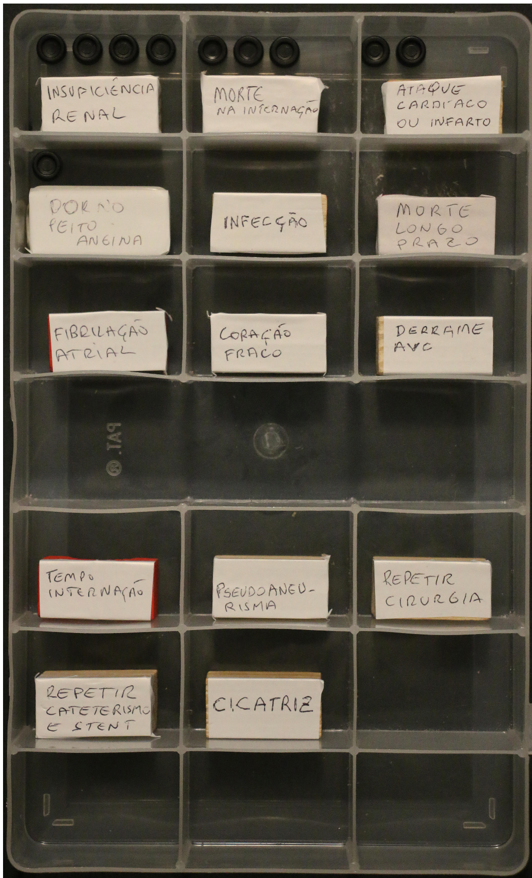
Figure 1 The dotmocracy rating method.