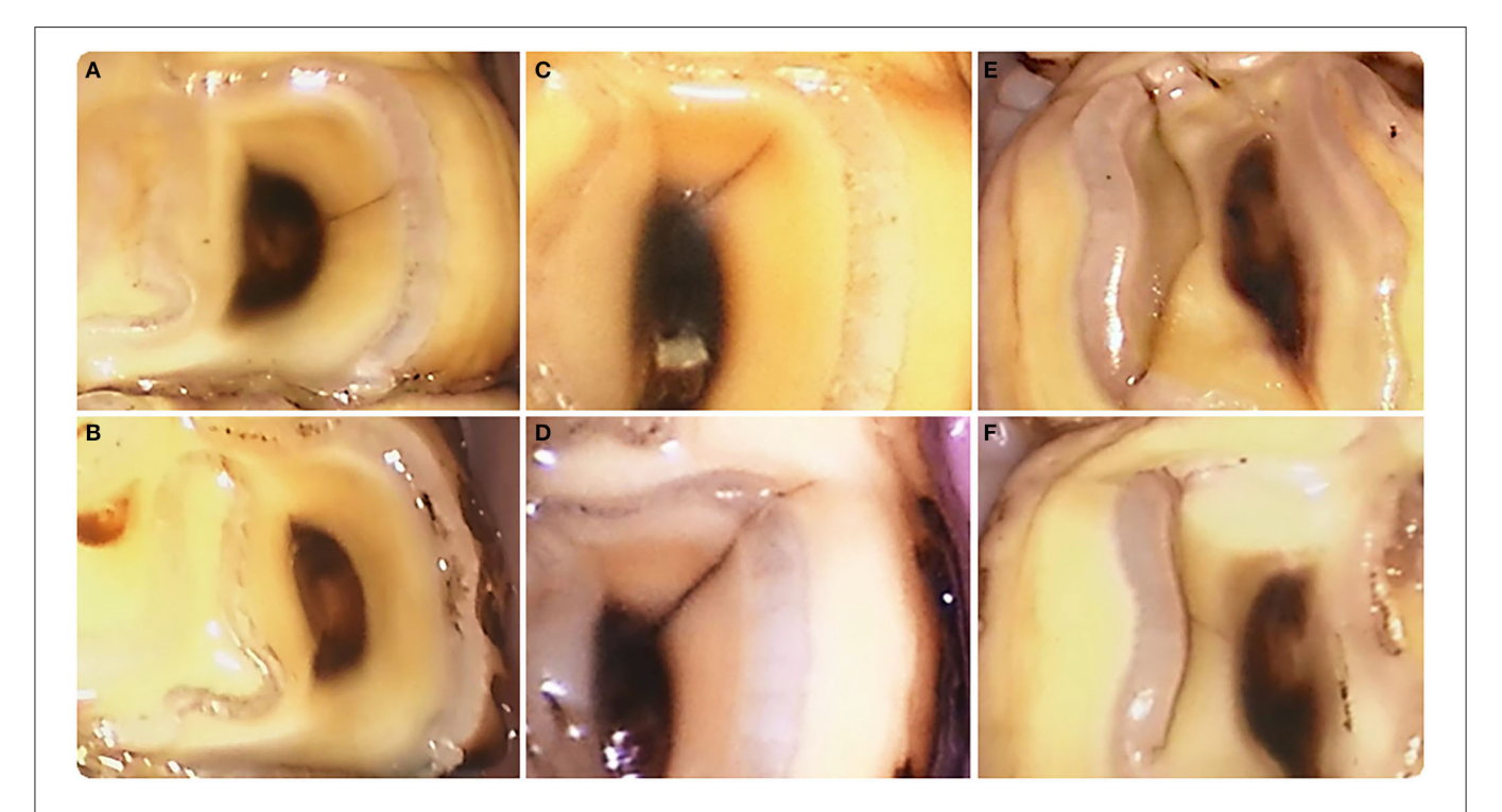
FIGURE 1 | Examples of fissure evolution in time. (A) Type 1a fissure at pulp horn 1 in a left mandibular first molar tooth (309) (T0). (B) This fissure had disappeared after 3 years (T6). (C) Type 1a fissure at pulp horn 1 in a left mandibular second molar tooth (310) (T0). (D) This fissure became longer after 1 year (T2) and developed into a crown fracture after 2.5 years (T5) (Figures 3A,B). (E) Type 2 fissure near the secondary dentine of pulp horn 2 in a right mandibular third premolar tooth (407) (T0). (F) Two and a half years later (T5) the fissure location was closer to the enamel ring. (A) is top left, (B) is bottom left, (C) is top middle, (D) is bottom middle, (E) is right top, and (F) is bottom right.

Fissure evolution was different in mandibular compared to maxillary cheek teeth, however only significantly for fissures that remained unchanged. In the maxilla, 72.4% of the fissures remained unchanged whereas in the mandible this was 62.4% (p = 0.003). Fissures changed in length/configuration/color in 18.1% in the maxilla and 23.3% of the mandible (p = 0.075). The number of fissures that disappeared was relatively similar in maxillary (10.2%) and mandibular (8.7%) teeth (p = 0.45). Fissure evolution was also different between fissure types. Type 2 fissures changed in length/configuration/color more frequently (44.7%, 21/47) compared to type 1a (20.3%, 95/467) and type