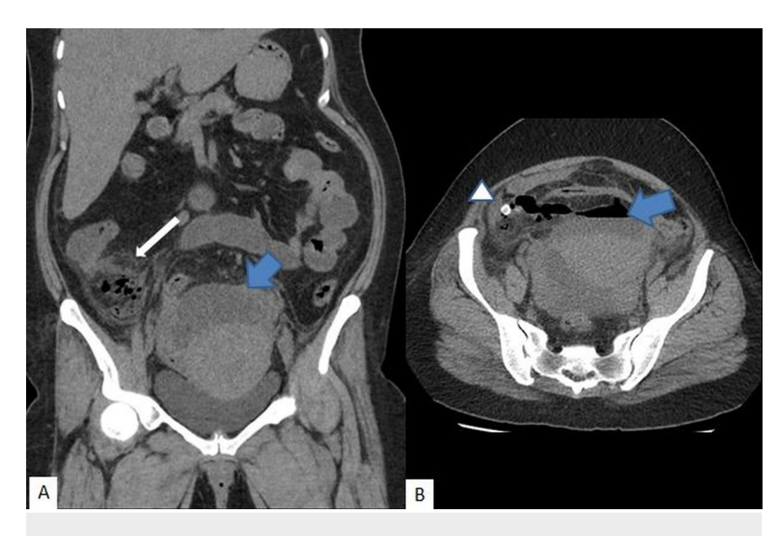
FIGURE 3: Acute appendicitis with perforation

A) Coronal and B) axial images demonstrated collection (blue arrow), inflammatory changes in the right iliac fossa (white arrow); appendicolith (arrowhead)