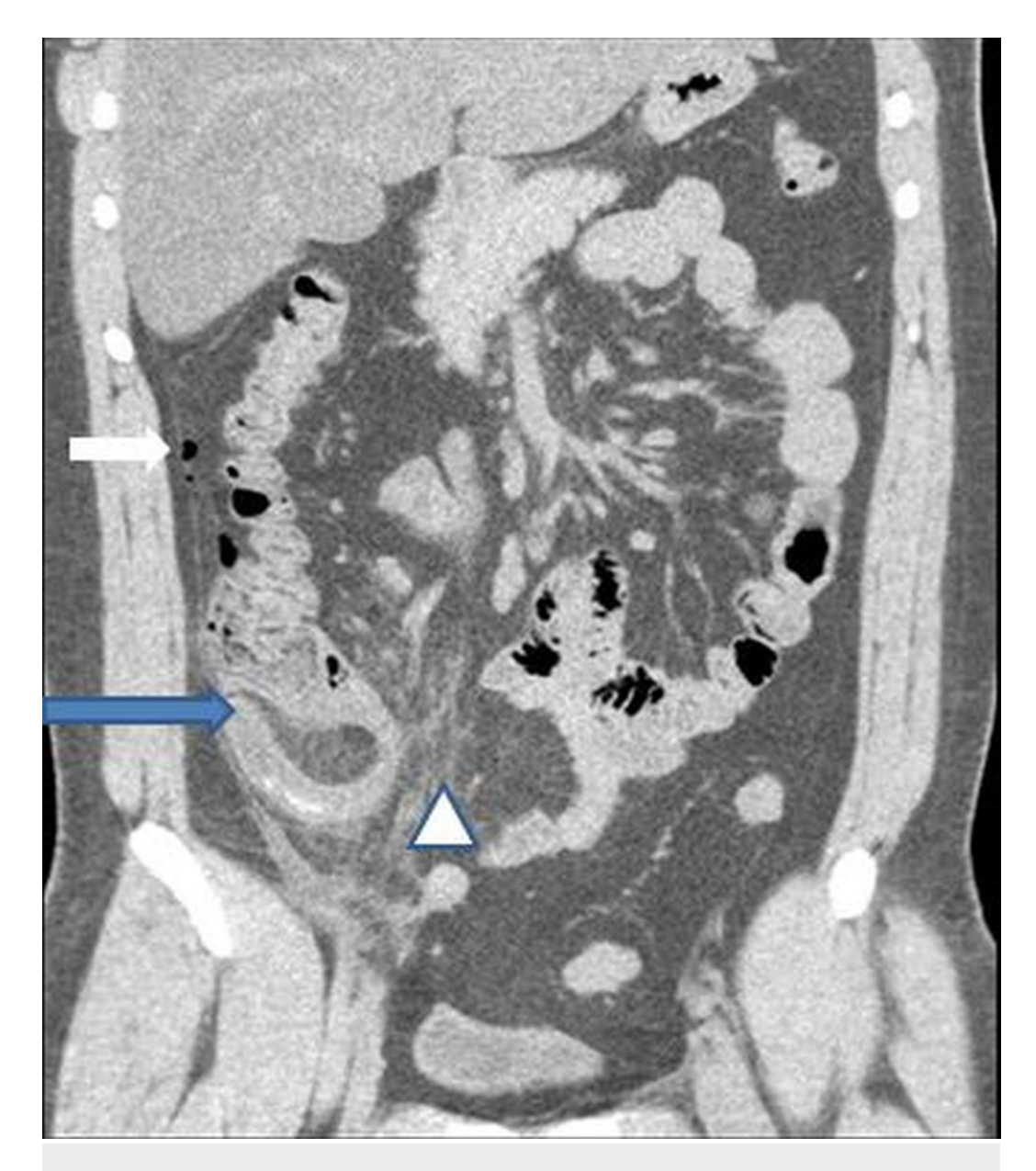
FIGURE 2: Coronal image of abdomen showing swollen appendix (blue arrow) with marked periappendiceal inflammatory fat stranding (arrowhead). Small amount of free air also seen (white arrow)

Specific signs for perforated appendicitis on CT scan included a defect in enhancing the appendiceal wall, focal area of nonenhancement with enhancing of the remaining appendiceal wall, extraluminal air, and extraluminal appendicolith or abscess formation (Figures 2-3).