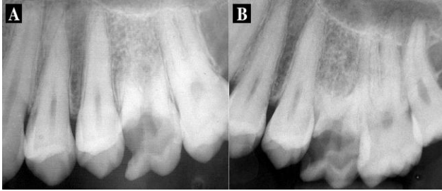
Figure 1. A) Periapical image of left maxillary first molar showing extensive coronal caries and severe root resorption in all three roots; B) A distal angulation showing extensive coronal caries and severe root resorption in all three roots

different angulations, cone beam computed tomography (CBCT) images were obtained. They confirmed the presence of the extensive external root resorption in all roots with no periradicular osseous lesion (Figures 2A, B). Hematological investigations, including complete blood count, serum calcium, phosphorus, parathormone and alkaline phosphates levels were taken to exclude any systemic disorders. All were found to be within normal limits.