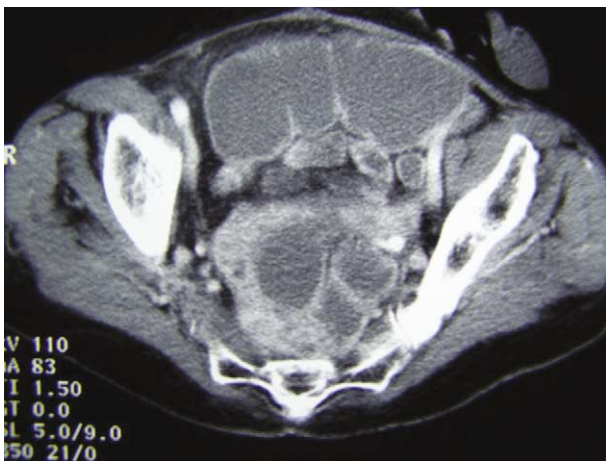
Fig. 2. Axial CT scan image shows thick capsule encasing bowel loops with proximal dilatation.

In the appropriate clinical setting, recognition of the entire dilated small bowel at the center of the abdomen and encased within a thick fibrocollagenous membrane, as though it were in a ‘cocoon,’ on a CT image is diagnostic of SEP. Yamada et al. reported a case of SEP associated with liver cirrhosis and complicated by diffuse, large B cell lymphoma (1). There are reports of perforation of cocoon, particularly in immune-compromised patients which carries a high risk of mortality. Banihani et al. have reported perforation complicating tuberculous cocoon in immune competent patients (2). Multidetector row CT is invaluable for pre-operative diagnosis of this condition and shows typical features of