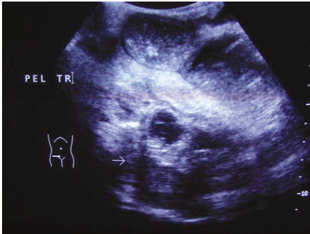
Fig. 1. Ultrasound image showing thick-walled capsule encasing bowel loops.

protein S deficiency, liver transplantation, fibrogenic foreign material, and luteinized ovarian thecomas) are the other rare causative factors. Abdominal distension, pain and vomiting, and presence of a soft non-tender mass at abdominal palpation, are the clinical features that may help in the pre-operative diagnosis of SEP.