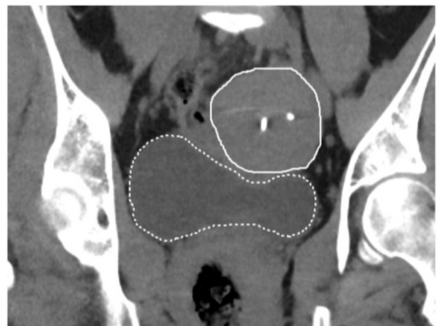
Fig. 2. Pelvic unenhanced computed tomography coronal images taken before (A) and after (B) menstrual cup removal. The arrowheads indicate the cup and the dashed and continuous lines the bladder and uterus, respectively. In B, the entrapment has resolved and the bladder has returned to its normal position.

of a 26-year-old MC user who had right renal hydronephrosis which resolved immediately after removal of the MC [7]. While their observations suggest that the shape and the size of the device were the main cause of hydronephrosis, our experience suggests that incorrect positioning could be another factor in the obstruction of nearby fine structures such as the ureters.