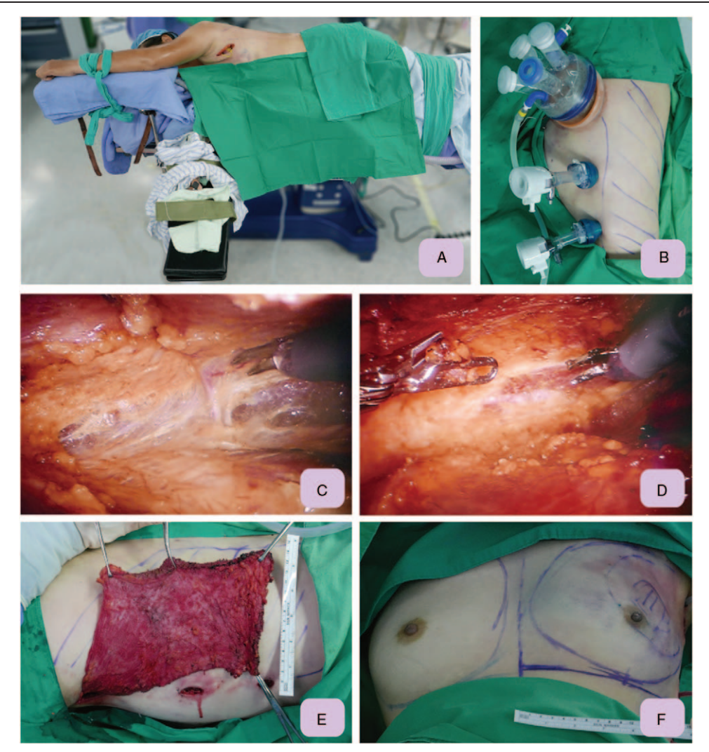
Figure 3. Demonstration of technique tips of IPBR with RLDFH. A, From the axillary wound, the thoracodorsal pedicle was identified and marked with a vessel loop. Then the wound was packed, and the patient was shifted to decubitus position. B, Two 12 mm balloon trocars (Kii Balloon blunt tip system, Applied Medical, Rancho Santa Margarita, CA) were used as port site for monopolar scissor and prograsp forceps. After all the 3 ports were set, the video camera was shifted to the middle port, and the monopolar scissors were shifted to the inferior port. The prograsp forceps were shifted to the inferior opening of the axillary accessory port. C, Dissection was suggested to begin along the undersurface of the muscle. After the undersurface of the muscle is dissected to the borders, the prograsp forceps is used to direct the anterior edge of the muscle toward the chest wall, and dissection proceeds over the superficial surface of the muscle. D, Once dissection is complete along both the deep and superficial surfaces, monopolar scissors are used to disinsert the muscle from the inferoporter oborder. As the muscle is released, it is gathered toward the axilla to maintain tension and visualization along the posterior border. E, The pedicled latissimus dorsi flap, which was harvested by robotic means, was ready for transfer to post mastectomy subcutaneous space. The wound was small over the axilla, and 2 1 cm trocar wounds could be used as drain exit sites. F, Front view of immediate post-breast reconstruction outcome. The flap was fixed internally in the resected defect to ensure full coverage of the post partial mastectomy defect. IPBR = immediate partial breast reconstruction, RLDFH = robotic latissimus dorsi flap harvest.

In small-to-medium-breast-size breast women with breast cancer who desire breast conservation, VR with autologous flap is in some circumstances a rational alternative to mastectomy.<sup>[6]</sup> The LDF is one of the most reliable flaps for VR and is often indicated when the resected volume is greater than 150 gm.<sup>[6]</sup> In this case report, the resected breast weight was 203 gm, which from our estimation was approximately 45% of the breast's volume. That led us to suggest that the patient receive VR with autologous LDF for partial breast reconstruction. The post-operative cosmetic result (Fig. 4) was quite good, and the patient was satisfied with the breast shape and wound result. The most frequent encountered complications of conventional LDF harvest were seroma formation, and wound related complications, like