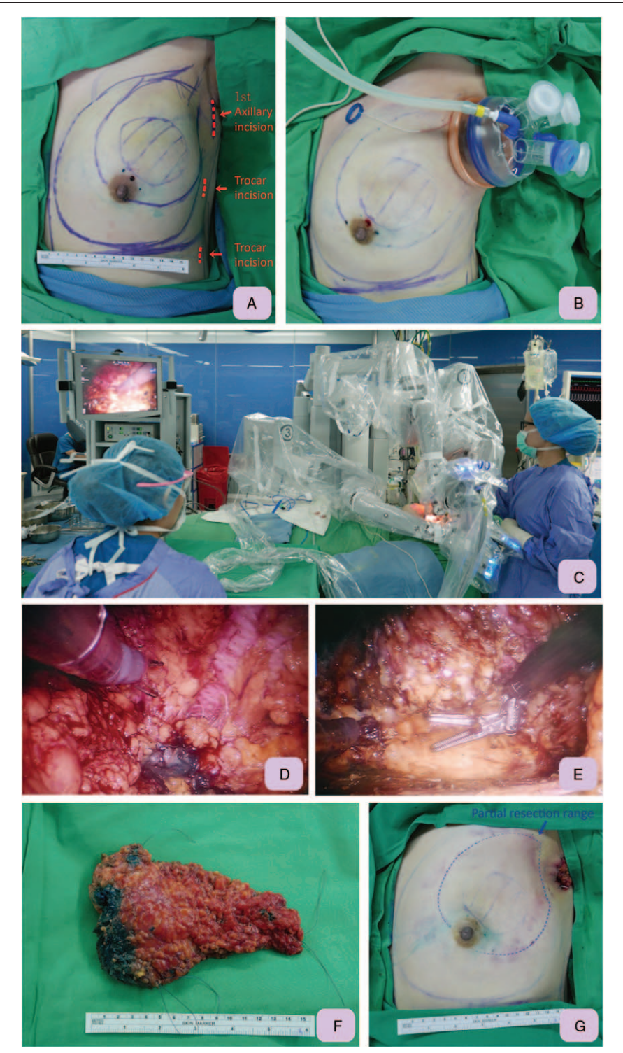
Figure 2. Demonstration of technique tips for RAQ. A, Pre-operative and intra-operative sonography was used to mark the location of the tumor and resection margin. Axillary incision and two additional trocar sites for RAQ and robotic latissimus dorsi flap harvest were marked with red dotted lines and arrows. B, After creation of the working space, a single port (Glove Port, Nelis, Gyeonggi-do, Korea) was inserted over the operating axilla. It was then inflated with carbon dioxide with air pressure kept at 8 mm Hg to create space for partial mastectomy. C, Picture shows the setting of RAQ, which was performed with a da Vinci Si (Intuitive Surgical, Sunnyvale, CA) robotic platform with the operating surgeon controlling at the console. D, Anterior skin flap dissecting was performed by dissection between skin flaps and breast glandular tissue with monopolar scissors. The parenchyma resection margin, which was created by methylene blue containing jelly. E, After peripheral dissection and parenchyma resection, the left upper outer quadrantectomy was removed through the axillary wound. G, Immediately post RAQ, the wound was small and hidden in the axilla region. However, a defect over the left upper outer quadrant was obvious due to a large portion of breast being removed. RAQ = robotic assisted quadrantectomy.