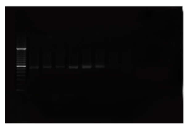
Fig. 1. Amplification of the ipaH gene. Lanes: 1, DNA molecular size marker (100-bp ladder); 2-7, Crohn's disease samples; 8, negative control (Water).