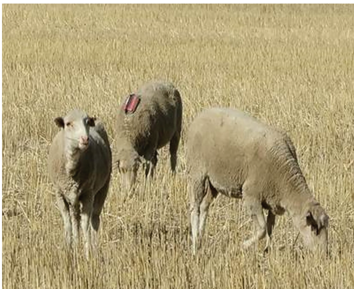
Figure 1. Sheep fitted with a waterproof location and behavior sensor.

It is time to reset the research direction and priorities on the use of technology for grazing systems. There are three clear priorities that can be derived from gaps in published research. The first priority is to establish end user interest and direction.