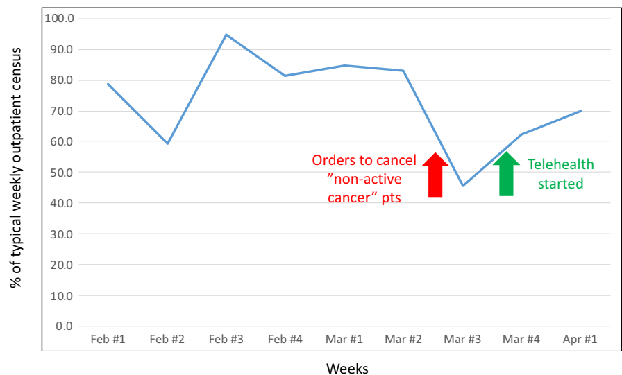
FIGURE 1 University of Cincinnati Center Patient Visit Volume During COVID-19 Pandemic. Total ambulatory visits by week, from Feb 1 to Apr 4, 2020, for cancer diagnoses. Benchmark for 100% is the average during a typical week, first quarter of 2019

Several study sponsors elected independently to halt enrollment to their trial temporarily due to the pandemic. It is