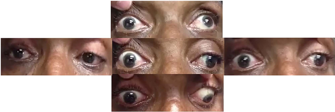
Figure 1: Clinical photograph of the patient's upper face revealed a complete ptosis of right upper eyelid. Elevation of right upper eyelid and evaluation of extraocular movements revealed absence of right eye movement in dextroversion, levoversion, sursumversion and deorsumversion.