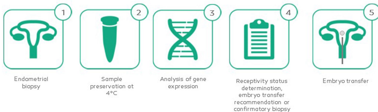
Figure 3. ER Map clinical procedure diagram.

as described elsewhere 10 . Results from the test allow the diagnosis of the receptivity status of the endometrium at the time of the biopsy and the identification of the WOI.