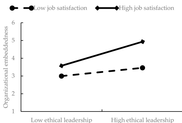
Figure 2. Moderating effect of job satisfaction on the relationship between ethical leadership and organizational embeddedness.

Note. N = 460 . * p < 0.05 , ** p < 0.01 . Job satisfaction high = mean + 1sd, Job satisfaction low = mean - 1sd, bootstrap sample = 1000.