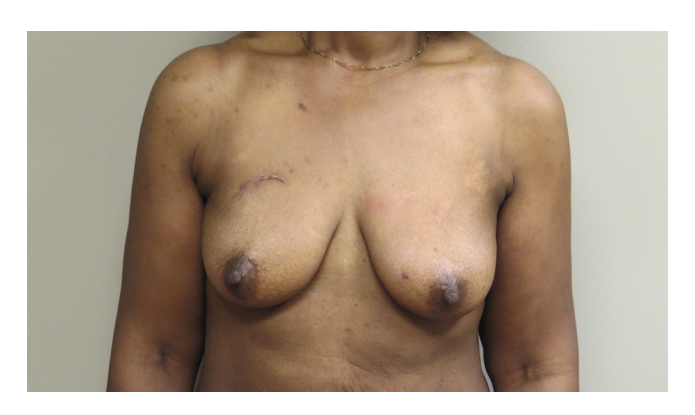
Fig. 1. 50 year old female with two sisters deceased from breast cancer and history of multiple breast biopsies demonstrating atypia. She has smaller breasts and requires lifelong anticoagulation secondary to a history of multiple DVT and PE.

and reconstructive surgery was completed in two and a half hours and intraoperative heparin was used without complication. We believe this reconstructive approach should be strongly considered in this growing patient population.