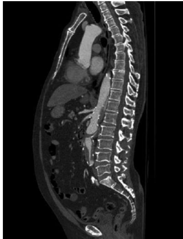
Fig. 2 Computed tomography angiography showing the subtotal occlusion of the aortic lumen just below the level of the renal arteries.

Following the operation, the patient's condition improved and he fully recovered from paraplegia. He was discharged home 4 weeks after the index procedure. CTA performed at this time demonstrated correct placement of the endografts with adequate exclusion of the false lumen, patency of all aortic side branches, and absence of any detectable endoleak. At this time, the patient was also screened for the most common genetic aortopathies but the tests were negative.