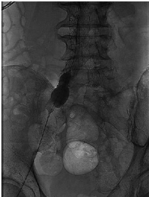
Fig. 3 Balloon occlusion of the right hypogastric artery during evoked potentials monitoring.

and the patient was discharged home 4 days after the operation.