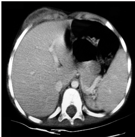
Figure 1. CT scan of the chest revealed a left chest wall mass with layering effects.