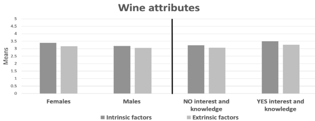
Figure 1. Mean of importance intrinsic and extrinsic attributes, genders, knowledge, and interest in the world of wine.

Of all the attributes selected for analysis, described in Table 3, Flavor, Aroma, Alcoholic Content, Ecological Characteristics, Price and Bottling showed significant differences concerning gender ( p < .05 ), with women granting greater importance to these attributes than men. However, concerning prior knowledge, except for the Ecological attribute, significant differences appear in the level of importance related to the attributes, reflecting a higher level of importance on the part of the participants with prior knowledge and interest in wine.