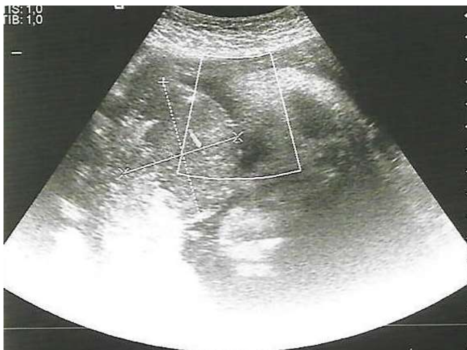
Figure 2: sonogram obtained at 34 weeks and 6 days' gestation shows the chorioangioma measuring 6.27 x 5.38cm