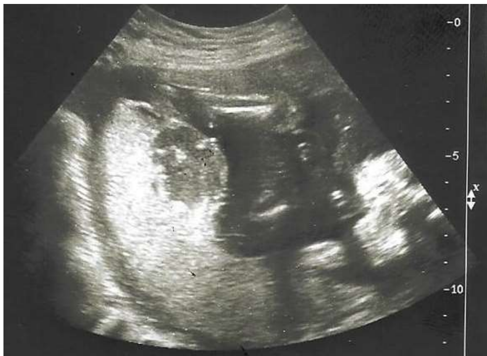
Figure 1: the placental chorioangioma on ultrasound at 21 weeks' gestation