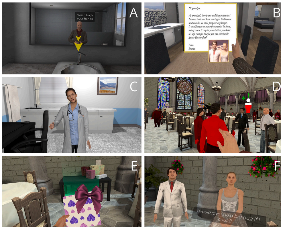
Fig. 1. Screens from the Virtual Wedding simulation. The simulation started with an embodiment bathroom scene (A). In the Gamified Immunity + Empathy condition, participants experienced additional narrative elements, e.g., receiving an invitation (B) or conversing with the granddaughter (F). Except for the Control condition, all participants visited a doctor (C) and tried not to get infected during the wedding scene (D). The participants were instructed to actively move around the wedding scene using gamified elements, e.g., delivering a gift (E).

(Fig. 1D) while fulfilling the tasks (Fig. 1E).