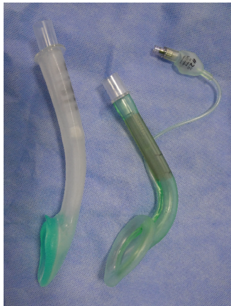
Figure 2 - Ergonomics of supraglottic airway devices. I-gel® mask (left) and Ambu® AO (right). The shape of Ambu® AOTM ventilating tube has a 90-degree angle.

maintain a clear airway, as in our study. In our study, the fact that the pediatric i-gel needed to be pushed in to indicates that the i-gel often slid out of the mouth (despite following the manufacturer's guidelines concerning fixation) and had to be secured in place with tape to achieve a sufficient seal to allow ventilation. The number of second-attempt insertions did not reach a statistically significant value. However, second-attempt insertions were comparatively greater in the i-gel group than in the Ambu AO group. Furthermore, this study demonstrated an increased number of second-attempt insertions with the pediatric i-gel. This factor may be attributable to the ergonomics of the tube, which may not be as user friendly as that of the Ambu AO (Figure 2).