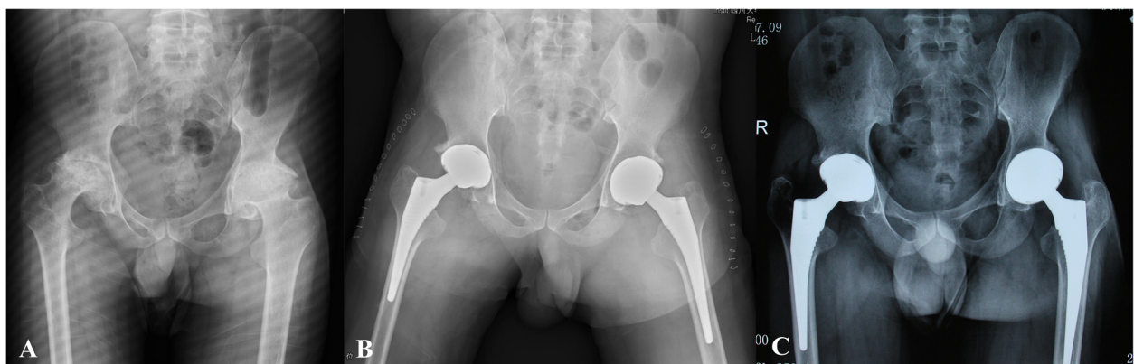
Fig. 5 Preoperative and postoperative X-ray of a patient seeking for bilateral THA because of haemophilia A. a Preoperative anteroposterior (AP) view of pelvis; b Postoperative AP view of pelvis; c One year follow-up AP view of pelvis (No progressive radiolucent line > 2 mm in width)