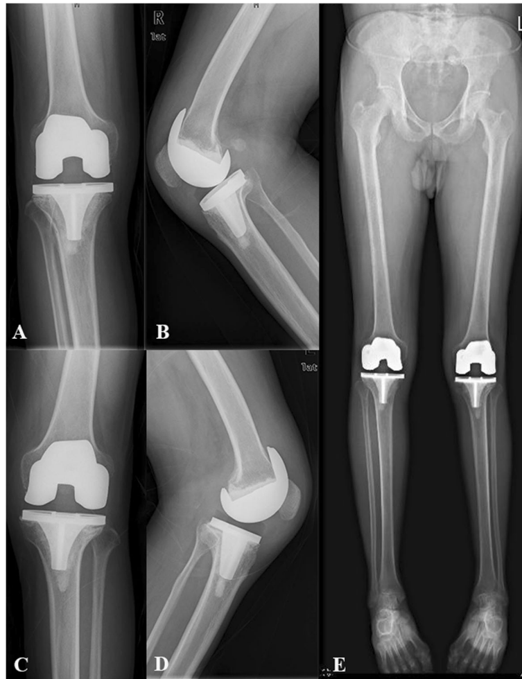
Fig. 4 One year follow-up X-ray of simultaneous bilateral TKA. a AP view of right knee; b Lateral view of right knee; c Anteroposterior (AP) view of left knee; d Lateral view of left knee; e Full-length standing AP view. (No progressive radiolucent line > 2 mm in width)