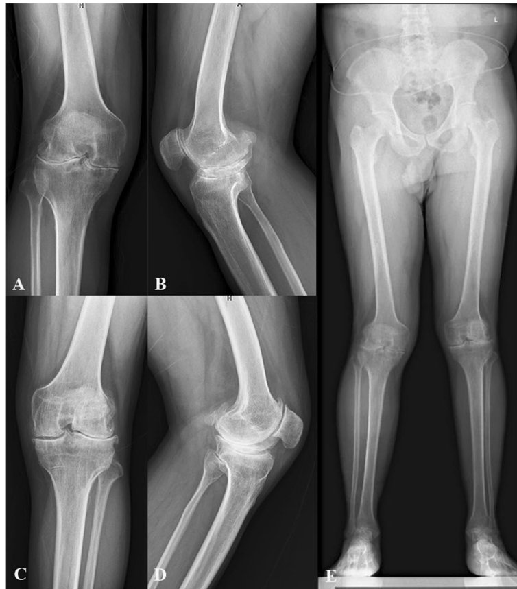
Fig. 2 Preoperative X-ray of haemophilic arthropathy of a patient seeking for bilateral TKA. a Anteroposterior (AP) view of right knee; b Lateral view of right knee; c Anteroposterior (AP) view of left knee; d Lateral view of left knee; e Full-length standing AP view

effects observed in TXA group. Firstly, previous studies showed that TXA could attenuate inflammatory responses through blockade of fibrinolysis [23–25]. Secondly and most importantly, TXA reduced total blood loss, translating into reduced total surgical trauma [17] since postoperative blood loss and pain were shown to positively synergize with postoperative inflammation and surgical trauma as demonstrated by CRP, IL-6 and IL-1 levels [17, 26], which might also explain why there was a lower joint swelling ratio observed in the TXA group during the postoperative days. Hølem et al. [27] have demonstrated that joint swelling after TJA is mainly due to intra-articular bleeding and inflammation of the peri-articular tissues. Since TXA can decrease not only blood loss but also local inflammation [14, 28, 29], it would not be surprising to find that patients in TXA group had a significantly lower swelling ratio compared to those from non-TXA group.