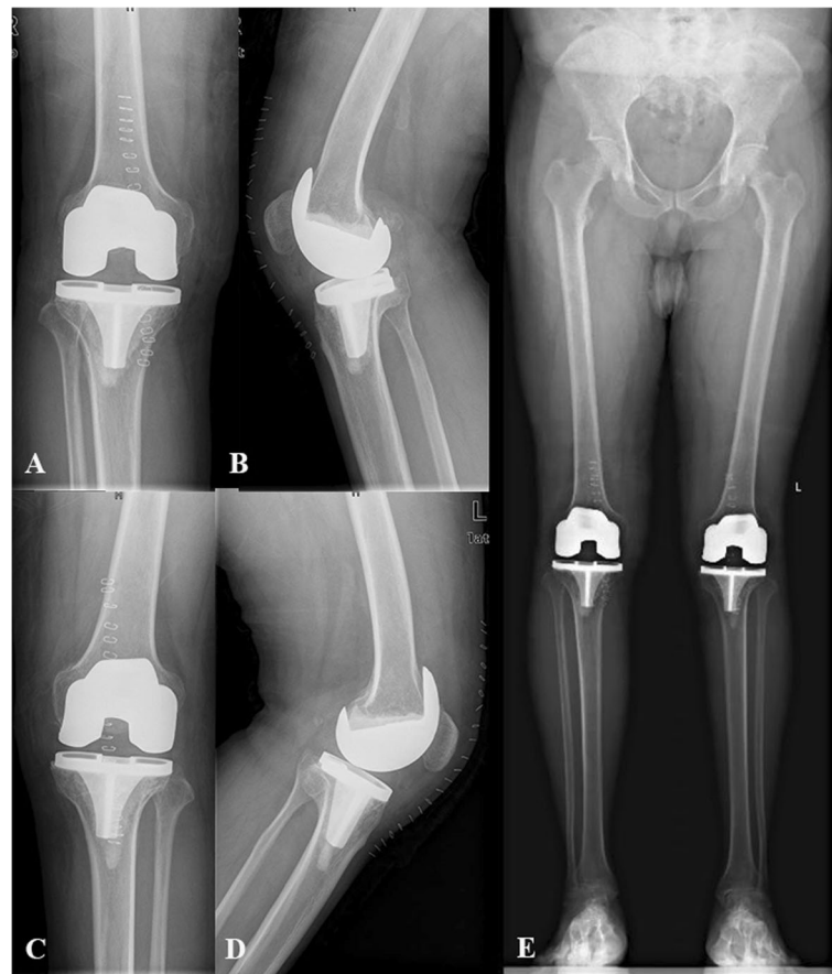
Fig. 3 Postoperative X-ray of simultaneous bilateral TKA. a AP view of right knee; b Lateral view of right knee; c Anteroposterior (AP) view of left knee; d Lateral view of left knee; e Full-length standing AP view

maintain a functional ROM [8, 32, 33]. However, we did not observe re-stiffness in our patients. That might be attributed to our emphasis on the early-reached required ROM in the rehabilitation program, that is to encourage patients to reach their maximum ROM during the first 48 h postoperatively before the contracture of the fibrous tissue around the surgical site and the previous rehabilitation is to maintain the maximum ROM.