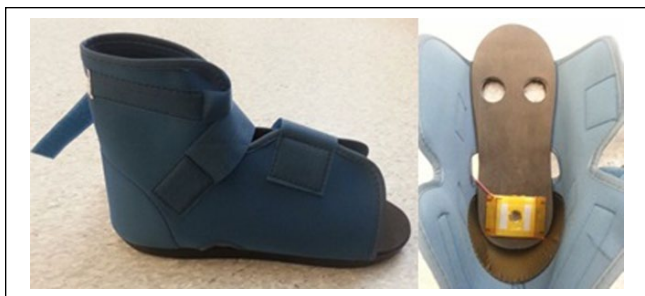
Figure 1. Actuator placed in a bandage shoe. Left: Transversal view of a (closed) bandage shoe. Right: Top view of an actuator placed inside an unfolded bandage shoe with holes in the sole. The actuator, with a 10 mm circular hole in the middle, is located at the heel placed above one of the holes in the sole of the bandage shoe in this figure. Please note that the actuator would be placed above the holes in the sole at MTP1 and MTP5 for the measurements at that location. The bandage shoe would be put on the foot of patients for measurements, and the biothesiometer placed exactly in the hole of the actuator for VPT assessment.

the actuator for VPT assessment. First, the sensation threshold for the actuator (ie, the minimum level of mechanical noise that the participant was aware of) was determined for each location separately. The output of the actuator was slowly increased until the participant indicated they did feel the noise and subsequently decreased from maximum output until the participant indicated they did not feel the noise anymore; the maximum output was the average of these two measurements. The stimulation level of the adapted actuator was set at 90% of this averaged threshold, to ensure the mechanical noise applied was subthreshold. If the maximum stimulation level was not felt, that level was used. VPT was measured three times at each location (MTP1, MTP5, and the heel) during two conditions (mechanical noise on or off). For each participant, the order of measurement conditions was determined by generating a random number (at http://www.random.org ), and following the sequence of conditions as marked by the generated number in a list with all possible sequences. Both the participant and investigator were blinded to the stimulation condition. The assistant-investigator applied the conditions in the determined sequence, while the investigator remained blinded and measured VPT. The average voltage of these measurements per location and per condition was calculated and used for further analyses.