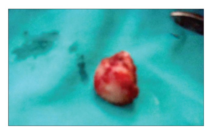
Figure 3: Excised cyst

lives in small intestine of man measuring 2-3 m in length with 800--900 proglottids. Each gravid segment contains about 50,000 eggs. The worm sheds gravid segments with eggs in the stool infecting pig and man. On reaching the alimentary tract of pig, the eggs rupture, liberating the oncospheres which penetrate the gut wall and reach the systemic circulation. They dislodge into different organs and muscle developing into larvae. Human beings are infected by eating raw contaminated pork containing cysticerci, which develops into adult tapeworm in the jejunum. Autoinfection may also occur by contaminated fingers or direct contact with another human carrier.[5,7] The worm sheds gravid segments laden with eggs in stool, reinfecting pigs and thus completing the cycle. These are partially digested in stomach, evolving to onchospheres and subsequently penetrate small intestine mucosa to disseminate throughout the body via arteriovenous and lymphatic channels. The clinical manifestations depend on location and number of cysticercosis at particular site. Intestinal infection by Taenia solium could be asymptomatic or may present with epigastric pain, nausea, and loose motions. In the case of neurocysticercosis, a patient presents with seizures and the other symptoms are related to the location and pressure caused by cysticerci in particular the region of the brain. Oral and subcutaneous