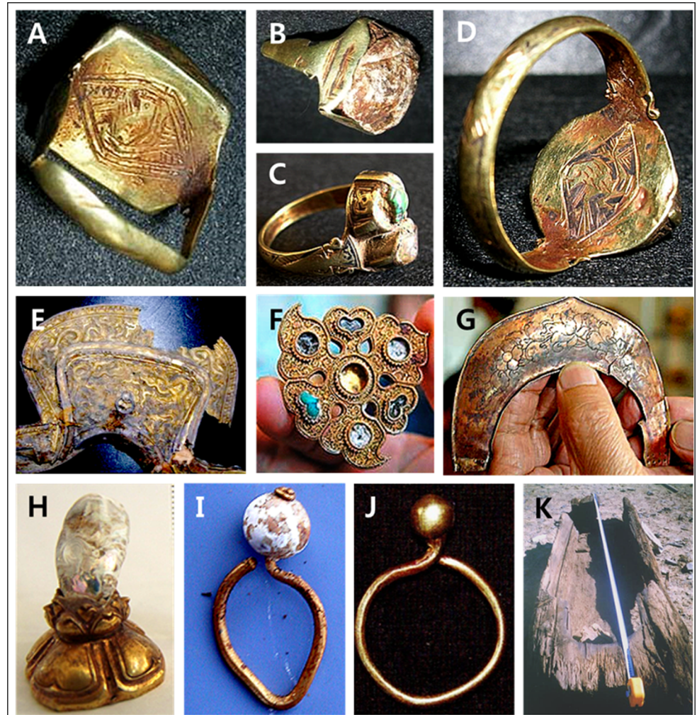
Fig 2. Some of the burial artifacts excavated from the Tavan Tolgoi graves. A-D: MN0105; A-B: a golden ring engraved with a falcon image, C-D: another golden ring engraved with the same falcon image as in A. E-G: MN0125; E: a saddle sheathed in gold dragon-shaped artistic decoration, F: the same golden ornament of boqta as those of the boqtas of Mongol khatuns in the design and shape, G: a golden ornament inside the boqta. H: Jins of MN0124. I: a golden earring of MN0126. J-K: MN0127; J: a golden earring, K: a coffin made of cinnamon.