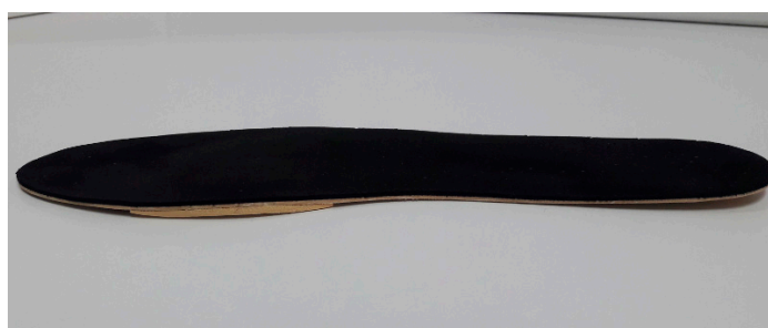
Figure 2. Typical Morton's extension orthotic (TMEO).

A flat sheet of ethylene-vinyl acetate (EVA) with an inverted rocker piece of EVA medium 6 mm thick under IMTPJ (bulked raised shape) covered with a yellow EVA soft layer that was 1 mm thick.