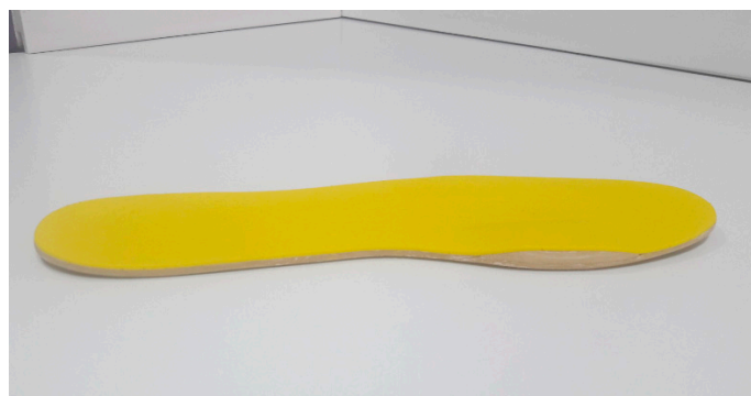
Figure 1. Novel inverted rocker orthotic (NIRO).