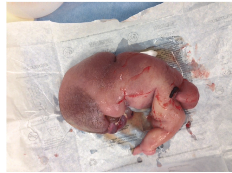
FIGURE 1: Case # 1: acardiac twin. Weight 1000 g.

The pump twin's neonatal course was complicated by RDS requiring intubation with surfactant administration.