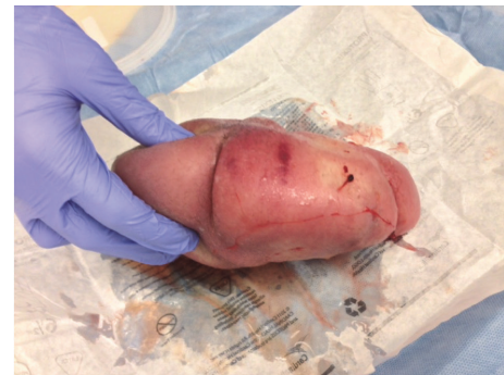
FIGURE 2: Case # 1: acardiac twin. View from above.

Neonatal echocardiogram confirmed mild left ventricular dilation and a small PDA. The infant was discharged home in stable condition 7 weeks after delivery.