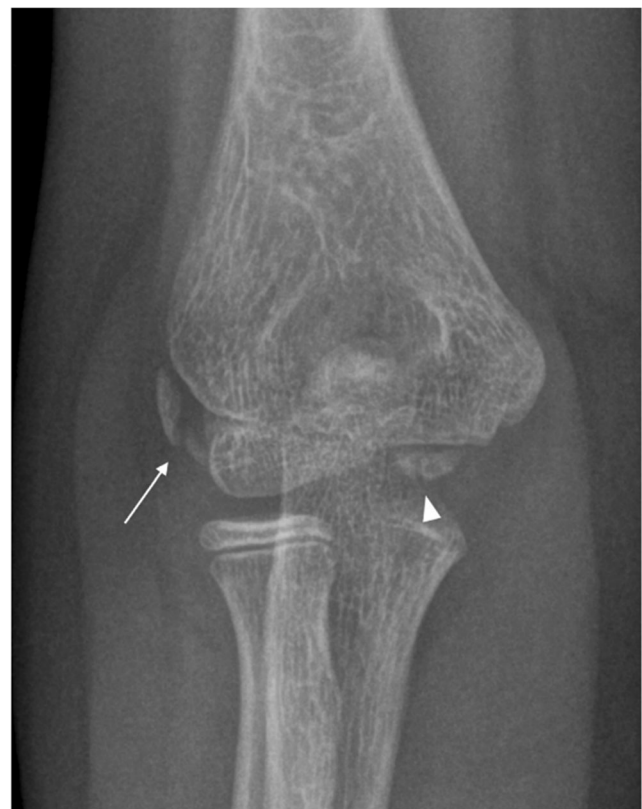
Fig. 2 Radiograph of the right elbow of a 10-year-old boy in anteroposterior projection showing a multipartite lateral epicondyle consisting of two portions (arrow). The trochlear apophysis is typically multipartite and in this case consists of at least two parts (arrowhead)

Some apophyses may be multipartite, representing normal variants of skeletal development, as shown in Fig. 2.