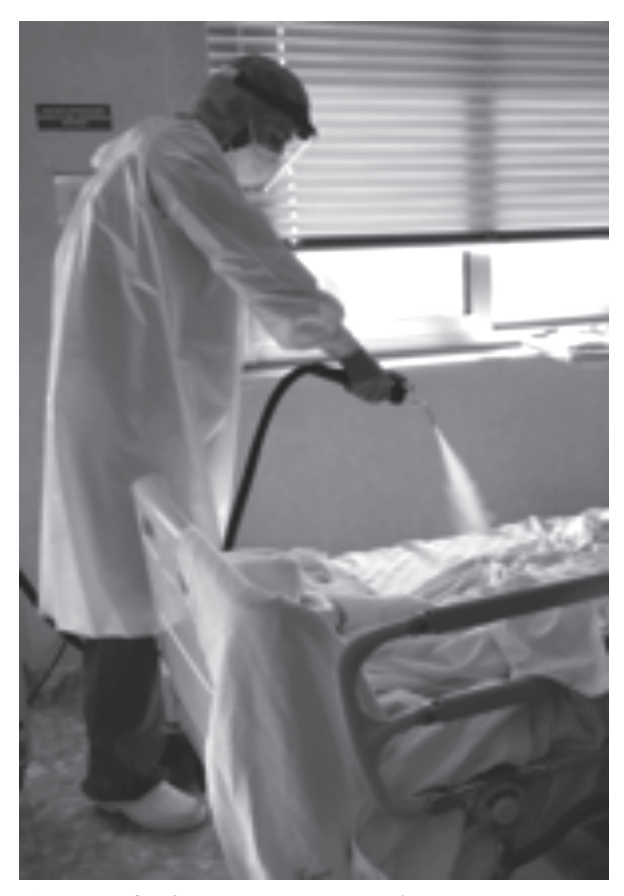
Figure 1 - Surface sanitization procedure

ordinary sanitization procedures and 12 after extraordinary sanitization procedures. One surface sample from an administration office was obtained outside the unit as a control sample. Eight samples were obtained from PPE: four from the inner layer of two