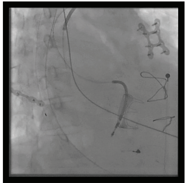
Figure 2: Right anterior oblique projection of the right atrial ICD lead.

the defibrillator lead was found to be compressing the septal leaflet, and its removal was deemed required for bioprosthetic valve replacement. The lead was cut immediately distal to the SVC coil and left in position in the right atrium. A bipolar epicardial RV pacing lead was subsequently implanted and placed in a pocket in her left upper abdominal quadrant. Epicardial patch(es) placement unfortunately was not performed. Postoperatively, the patient was noted to have developed complete atrioventricular block and atrial flutter. Her ventricular rhythm was maintained via temporary epicardial pacing wires placed at the time of her surgery. The electrophysiology service was consulted with regards to permanent pacing and defibrillation options.