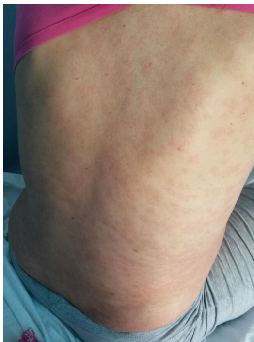
Figure 5. Residual erythematous patches after systemic corticosteroid treatment.

The patient was discharged after 12 days and had an uneventful pregnancy course upon 36 weeks of gestation, when she gave birth via cesarean section to a 2650 g baby girl because of premature membrane rupture. The maternal dermatological condition did not influence the onset of birth. The evolution of the newborn was favorable, and the postnatal adaptation was appropriate, without dermatological lesions or other diseases. At 3-month follow-up, the patient did not report any skin lesion.