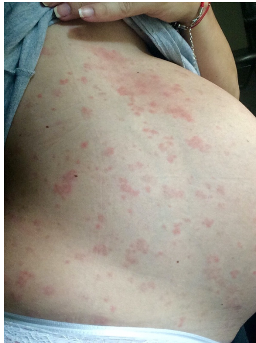
Figure 3. Close representation of the papules and plaques on the abdomen.