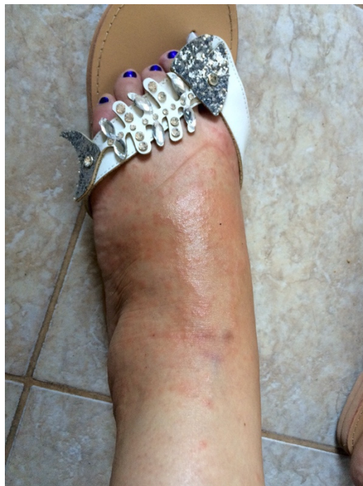
Figure 4. Confluent papules present on the feet.

Ultrasound evaluation showed a 32-week fetus with normal morphology, with an estimated weight of 2350 g (above 90th percentile), and slightly tachycardic (fetal heart rate: 180–200 bpm). The amniotic fluid index (AFI) was within the normal range. All paraclinical investigations were within normal limits, including additional immune tests for anti-neutrophil cytoplasmic antibodies (c-ANCA), perinuclear ANCA ( p -ANCA), circulating immune complexes, and rheumatoid factor. Due to fever persistence, the patient was transferred to an infectious diseases ward, where an infectious cause was excluded. Virology and parasitology tests revealed no active infection with rubella virus, enteric cytopathic