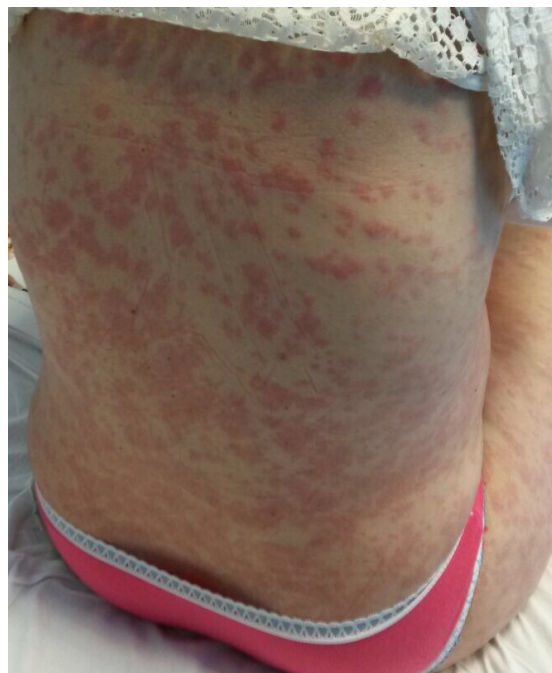
Figure 2. Erythematous papules and plaques on the trunk and inferior limbs. Lesions vary in size from 0.5 cm to large confluent areas.