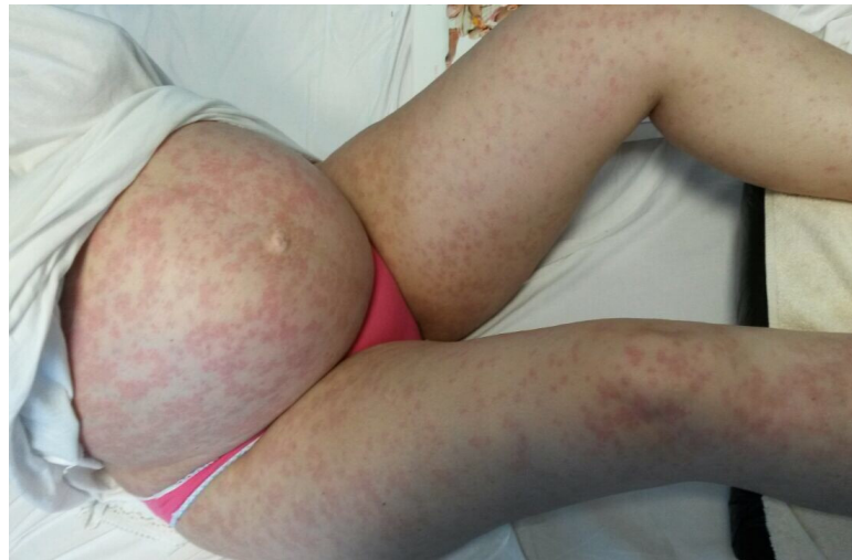
Figure 1. A monomorphic rash consisting of erythematous papules and round oval plaques disseminated on the abdomen and lower limbs, that spares the umbilicus.

A 36-year-old, 32-week primiparous pregnant woman was referred to our service with an extensive pruritic rash that initially appeared as erythematous papules on the abdomen. They had rapidly spread to the trunk, thighs, buttocks, calves, legs, and arms, being unresponsive to topical corticosteroids (Figures 1–4). On admission, clinical examination showed a body temperature of 38 °C. The patient denied other illnesses and had a weight gain of 15 kg during the first two trimesters of pregnancy.