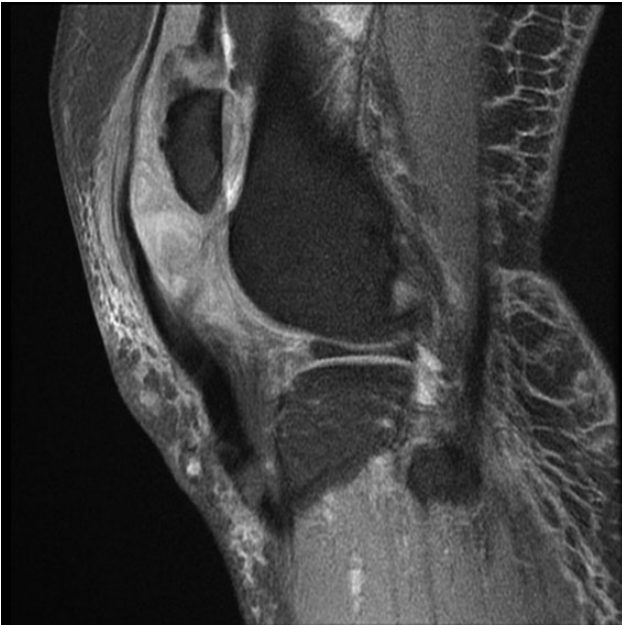
Figure 2: MRI right knee. Sagittal T1 image. Demonstrating rupture patellar tendon attachment from inferior pole of patella, high riding patella, chronic tendinosis of patellar tendon and clustering of sheared quadriceps tendon.

Surgery was performed on the knee. A midline longitudinal incision was made, revealing a complete rupture of the patellar tendon from the inferior pole of the patella, torn medial and lateral retinacular fibres, and near complete shearing of 90% of the quadriceps tendon (Fig. 3). The patellar tendon was anchored trans-osseously with 5 TiCron™ (Covidien) sutures, and further strengthened with 2/0 vicryl sutures using the Kessler technique. Both the quadriceps tendon and retinaculum were primarily repaired using 2/0 vicryl sutures. Postoperatively, the knee was immobilized in a long leg back slab for 2 weeks, followed by cylinder cast for 4 weeks. Patient was gradually worked towards full weight bearing afterwards. At 8 weeks post-surgery, patient was able to fully extend his knee, and perform straight leg raise against gravity. His range of flexion improved with physiotherapy from 30° to 100° at 3 months following surgery.