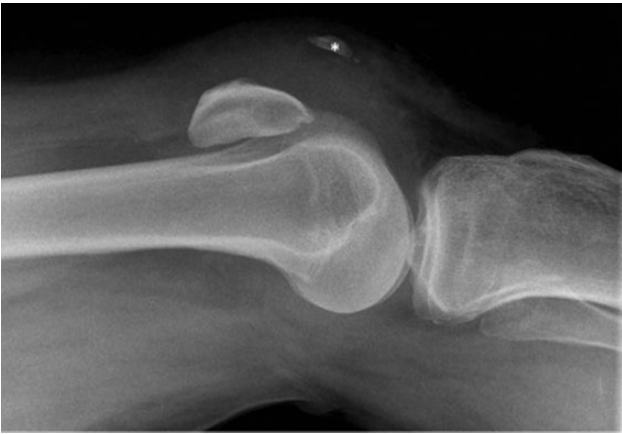
Figure 1: Lateral radiograph of right knee, demonstrating patella alta and ectopic ossification of the patellar tendon (marked *). No evidence of acute fracture.