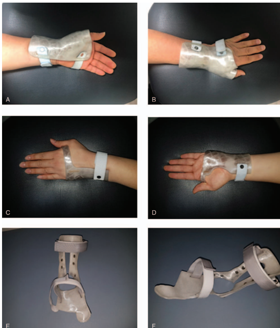
Figure 1. Wrist orthosis for carpal tunnel syndrome: (A) palmar view, (B) dorsal view. Ulnar wrist orthosis: (C) palmar view, (D) dorsal view. Ankle-foot orthosis: (E) anterior view, (F) lateral oblique view.

right-ankle dorsiflexor muscle strength had grade 2 on the Medical Research Council scale. She demonstrated hypoactive, patellar tendon reflexes on the right side. Imaging examination via magnetic resonance imaging on her lumbar spine showed