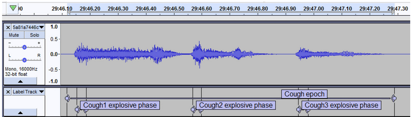
Figure 3 Labelling example for cough explosive phases and epochs. Screenshot taken in Audacity 2.2.2. ( https://www.audacityteam.org ).

describe coughing that are proposed by the European Respiratory Society. 10