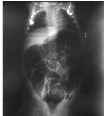
Figure 2: Air enema reduction