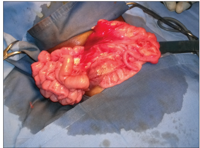
Figure 6: Conservative procedure

ischaemia and intestinal obstruction are secondary factors and reflect the low level of medical skill as well as the lack of type definition. [9,10] The “Doughnut sign” was found in all cases in which the diagnosis of IAI was made. In 8 cases, rule out ischaemia of involved bowel was mentioned, but air enema reduction was successful. In 3 cases in which ischaemia was diagnosed by Doppler with the associated bad condition, open surgery was first indicated and did not find ischaemia but easy manual reduction. The abdominal X-ray sensitivity remains controversial, and our work has noticed ultrasound diagnosis in 55% of cases contrary to X-ray one which stands only for 5% of cases.