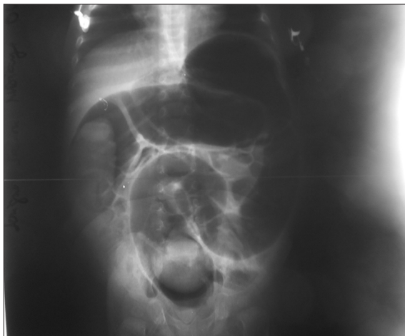
Figure 1: Meniscus sign beneath liver's shadow

Abdominal ultrasound particularly when associated to coloured Doppler and lead by paediatrician radiologist is the key element of diagnosis' rapidity which constitutes the only prognostic factor influencing therapeutic outcomes. The others prognostic elements such as abdominal distension,