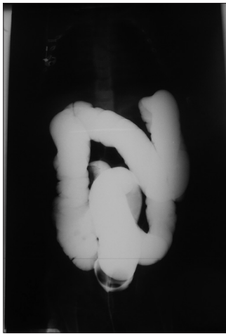
Figure 3: Barium enema reduction