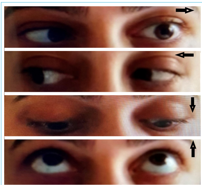
Figure 1. Patient's photograph revealing her eye movements (arrows) and left abducens nerve palsy.