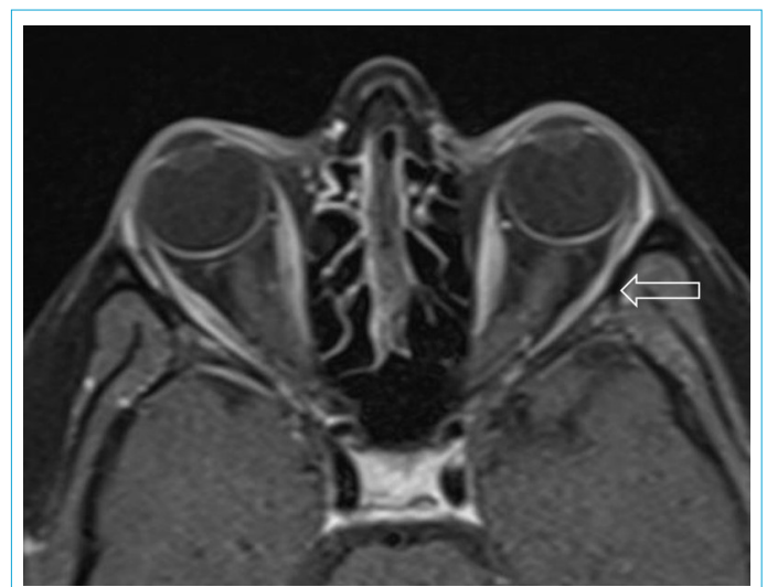
Figure 3. Slight thinning of the left lateral rectus muscle (arrow) on axial T1 fat-saturated post contrast orbital MRI.

Data System). No pathology was observed in cranial CT, diffusion-weighted MR imaging (MRI), cranial MR angiography and venography. Slight thinning of the left lateral rectus muscle was detected in orbital MRI (Figs. 3, 4). In cranial MR imaging, there were non-contrast-enhanced, non-specific, hyper-intense lesions on T2/Flair sequences in periventricular and subcortical deep white matter. The lumbar puncture was performed and CSF's (cerebrospinal fluid) opening pressure was normal (155 mm H 2 O). The CSF was clear, the CSF biochemistry and culture were normal. The oligo clonal band was negative and the Ig G index was normal (0.46). Her CSF PCR for CMV (Cytomegalovirus), EBV (Epstein-Barr virus), VZV (Varicella-zoster virus), HSV-1 (Herpes simplex virus-1) and HSV-2 were negative. Labora-