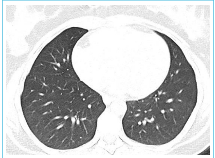
Figure 5. Patient's thorax CT was normal after 10 days of treatment.

Neurological manifestations of SARS-CoV-2 such as cerebrovascular diseases, infections of the central nervous system, cranial nerve disturbances (hyposmia, anosmia, vision impairment, dysgeusia, facial pain, dysphagia, ophthalmoparesis), and autoimmune and inflammatory syndromes (Guillain-Barre syndrome, Miller-Fisher syndrome and polyneuritis cranialis) have been reported. [9]