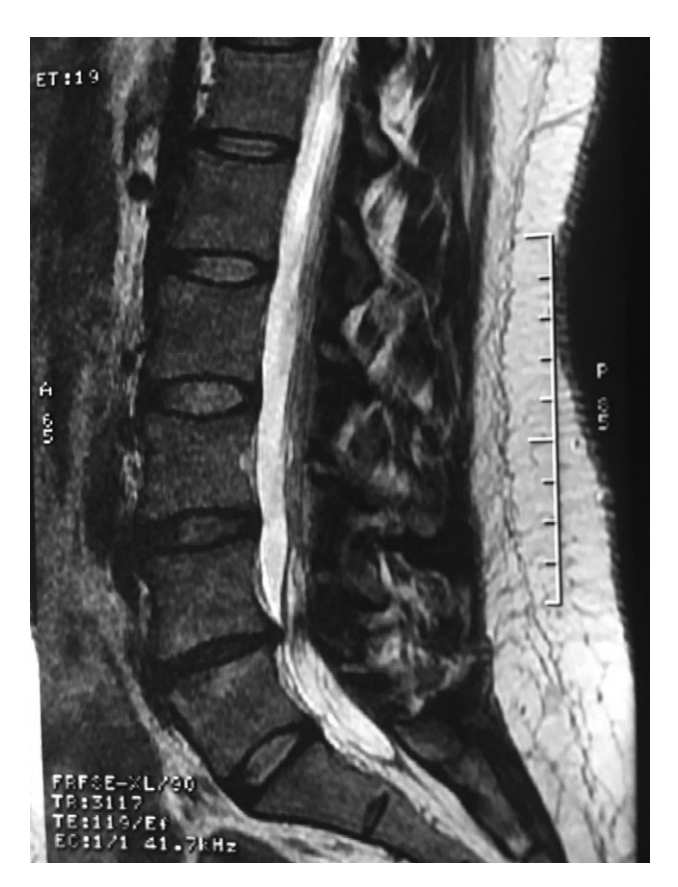
Figure 5: Showing the protective effect of the limitation of the motion in the distal disc to the anomaly.

radicular involvement. An extended surgical approach will be necessary in patients with persistent pain. New techniques such as 3D guided surgery and minimally invasive procedures can be applied to this pathology with good results [8-10].