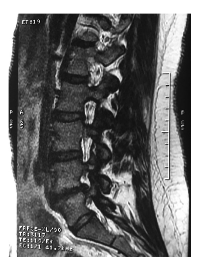
Figure 4: Showing the protective effect of the limitation of the motion in the distal disc to the anomaly.

The partial fusion at the lower part of the lumbosacral transition produces important alterations in normal biomechanics at the levels immediately above and below the LSTV. Changes such as hypermobility and abnormal torque moments